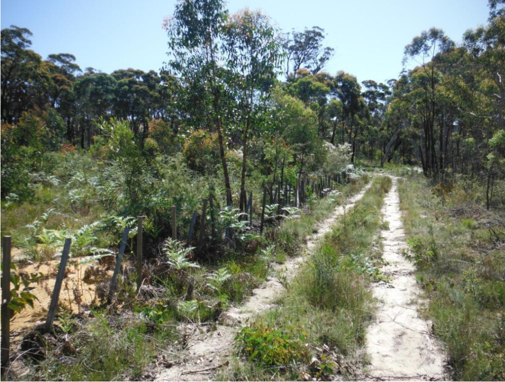
Photo C: Site works looking west including remains of old E & S fence