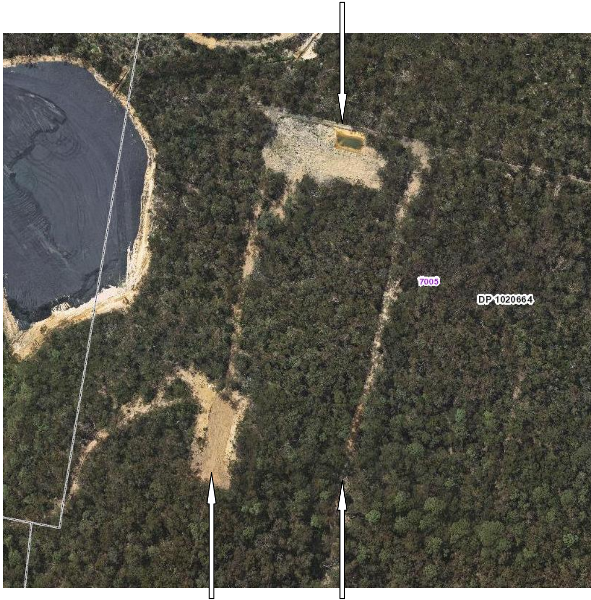
Trial excavation site – now rehabilitated

Initial physical commencement cleared area and detention basin works – photos A, B & C