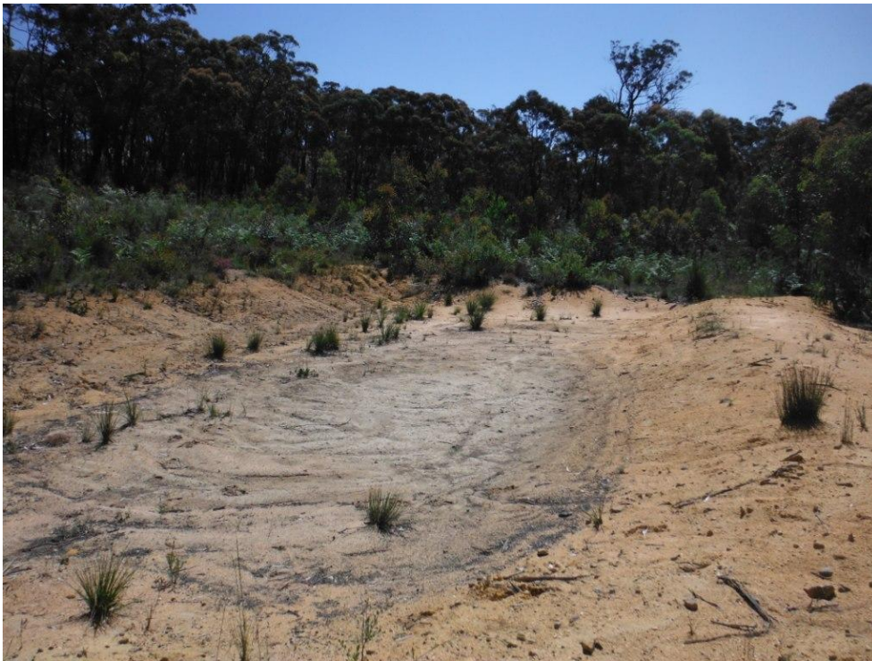
Photo A: Site works - Detention pond constructed as part of physical commencement works in March 2011