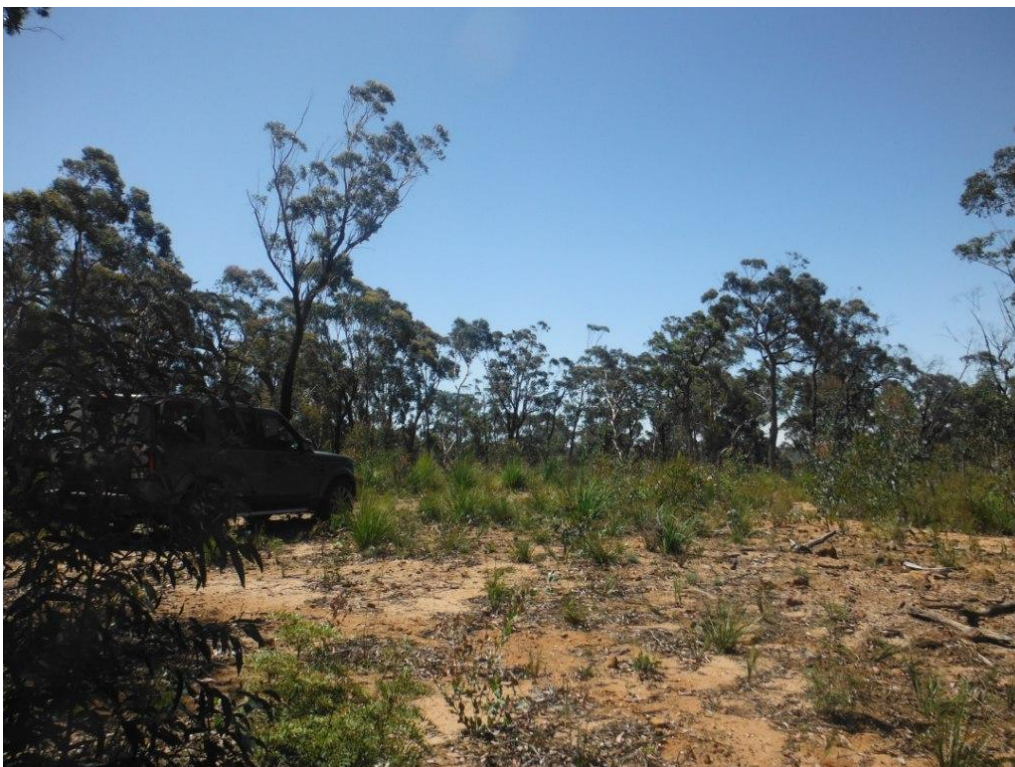
Photo F: Trial excavation site – now rehabilitated – photo December 2015 – looking north west