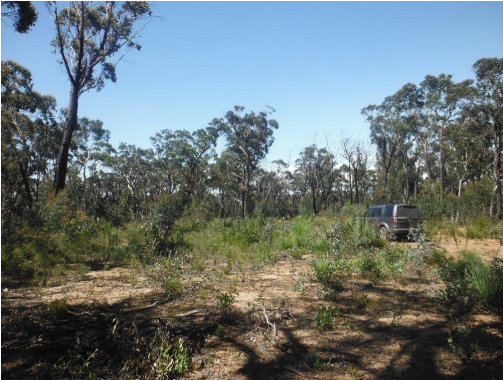
Photo E: Trial excavation site – now rehabilitated – photo December 2015 – looking north east