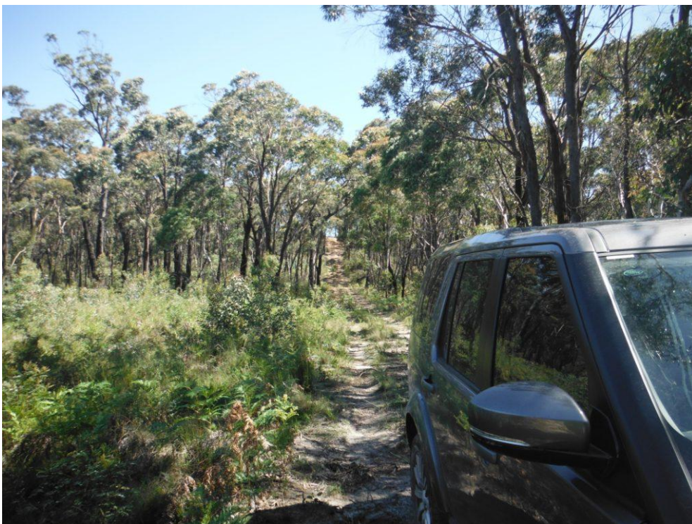
Photo B: Site works looking south towards trial excavation site in distance